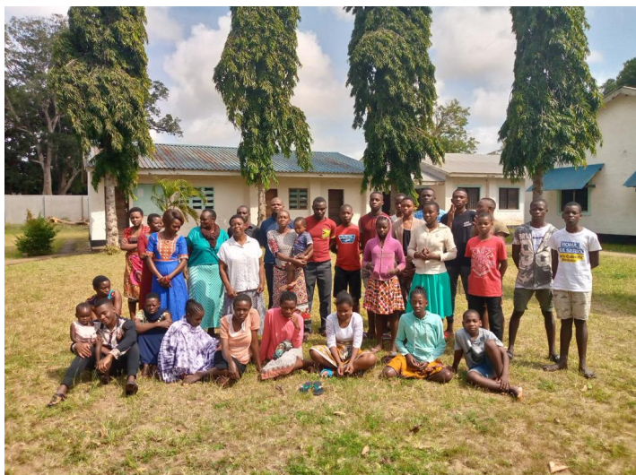
Some of our kids with the teachers.